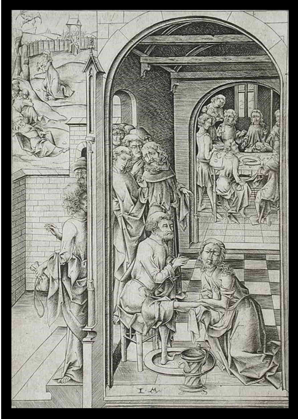
“Christ Washing the Feet of the Apostles” Israhel van Meckenem the Younger (ca. 1440-1503)